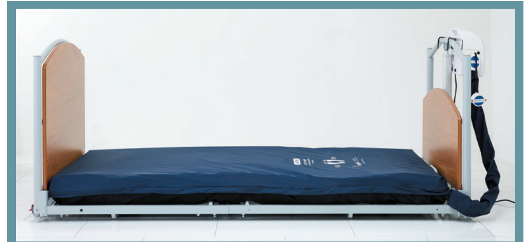
VesTIMs dynamic mattress on Carer Floor Bed